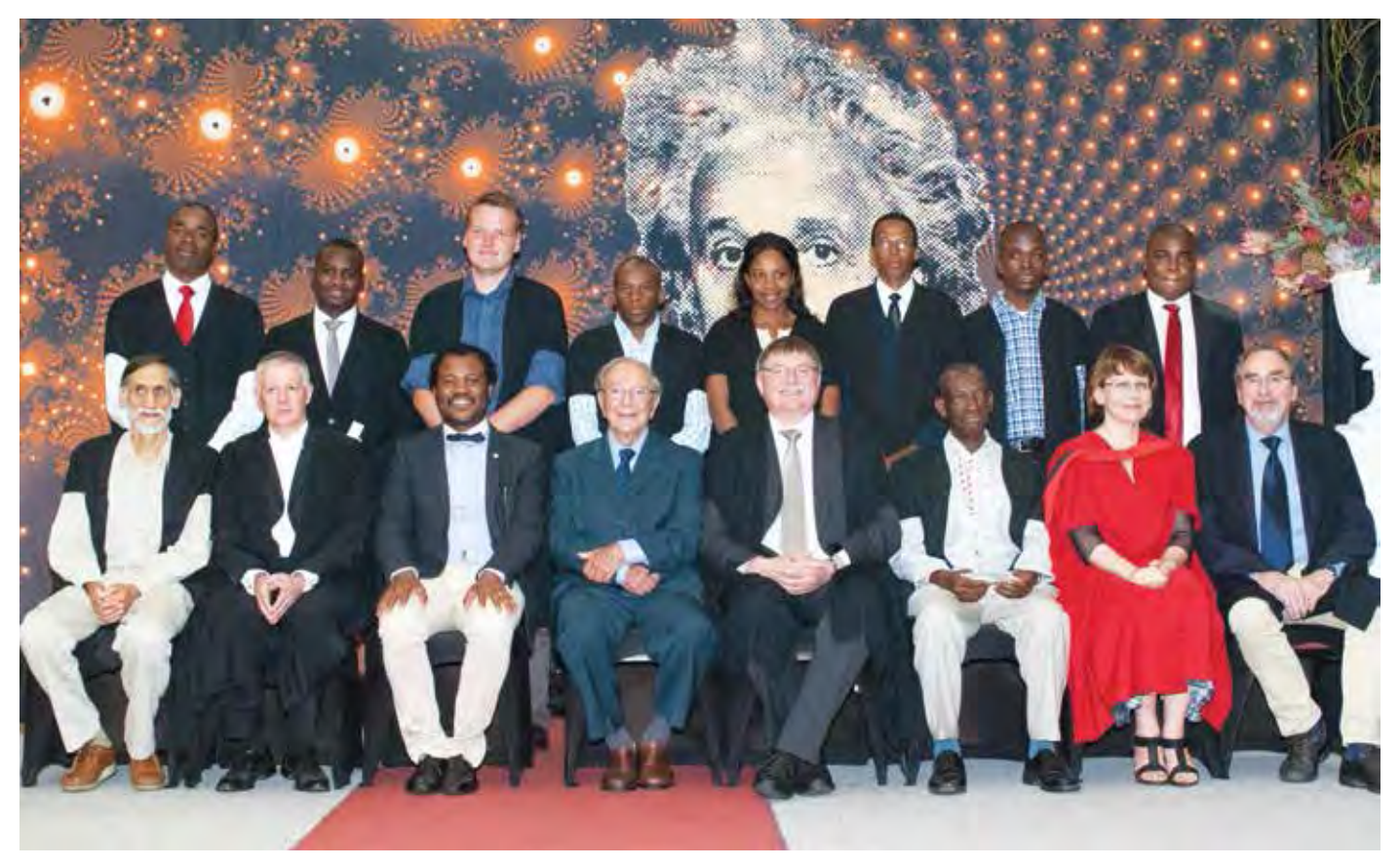
Recognition of Achievement Ceremony November 2013