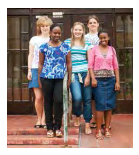
2014 BSc Honours in Mathematics with a focus in Biomathematics students