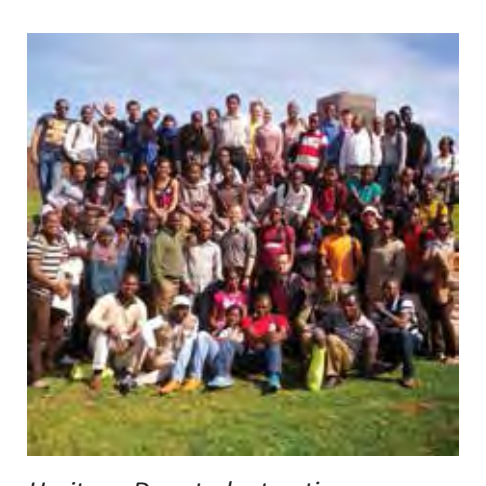
Heritage Day student outing, September 2013