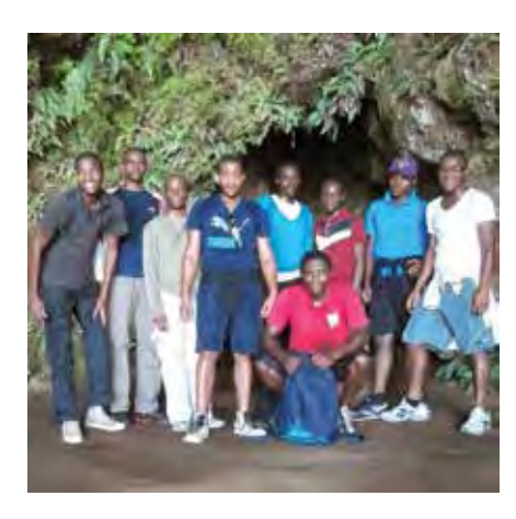
Student hike, February 2014