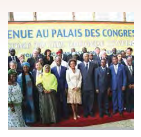
AIMS Cameroon launch February 2014

"The opening of a fourth institute in Cameroon is important because it adds to a growing force for Africa. It increases a pivotal pool of young scientists ready to meet the developmental challenges of this continent."