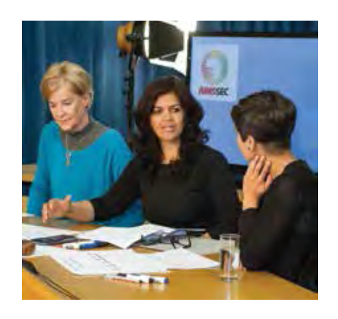
AIMSSEC broadcasts whole day TV lessons for mathematics teachers via satellite to learning centres around South Africa.

Over the past eleven years, the AIMSSEC three-month Mathematical Thinking course has been run twenty-two times for 1 240 teachers and subject advisors from all parts of South Africa. There is significant evidence that the Mathematical Thinking course is transformative. The Mathematical Thinking summary report indicates that there has been progression from one assignment to the next. This is primarily due to the teachers' exposure to learner-centred activities during the