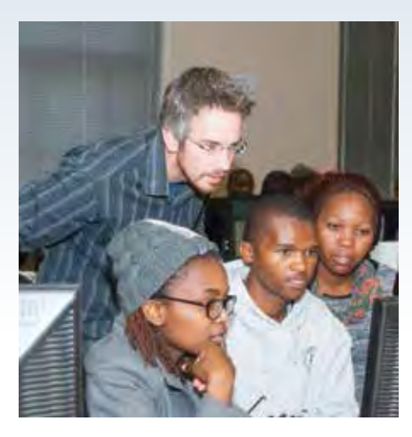
".... the way the lecturers contributed to the workshop seemed like it was a calling for them rather than a job or something they've been asked to do and that kind of a spirit is very stimulating and exciting."

camp from 30 June to 6 July, before participating in the International Mathematical Olympiad (IMO) hosted by UCT from 8 to 9 July. Team members (all high school learners) from Benin, Burkina Faso, Gambia, Ghana, Ivory Coast, Morocco, Nigeria, Tanzania, Tunisia, South Africa, Uganda and Zimbabwe attended mathematical lectures and reviewed previous IMO papers to ensure that they were exposed to as many as possible mathematical problems and could practice how to get to the answer with the best possible solution. The main sponsors of the 2014 IMO were the Department of Basic Education, Google, SABC Education, South African National Roads Agency Ltd and Sasol.